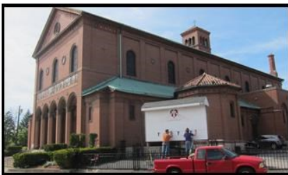
St. Luke's Mission of Mercy

To learn more about St. Luke's on Buffalo's east side, go to their website: www.stlukesmissionofmercy.org