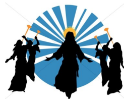
Ascension Day Thursday, May 10

The story of Jesus' Ascension is told in Luke 24:49, Mark 16:19 and Acts 1:3, 9. Putting these accounts together, we find that after his resurrection, Jesus appeared several times to his disciples and others. He spoke to them about the kingdom of God and the coming of the Holy Spirit, for whom they were to wait (Acts 1:2-9). After 40 days of these appearances, he was taken up to heaven for the last time (Acts 1:9-11). As the disciples watched him go, two angels appeared and declared to them that, just as he ascended, Jesus would return in glory.