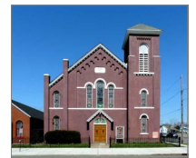
Current view of the church building

So drive down to "Food Truck Tuesdays" at Larkinville and see our original church. It is still in use by the congregation we sold it to--the Delaine Waring AME Church. A neat diner is next door to the church and there are many activities weekly at Larkinville.